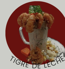
TIGRE DE LECHE