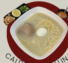
CALDO DE GALLINA