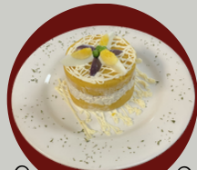
CAUSA DE POLLO