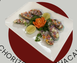
CHORIZOS A LA CHACALA