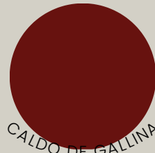
CALDO DE GALLINA