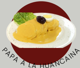
PAPA A LA HUANCAINA