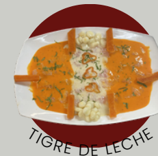
TIGRE DE LECHE